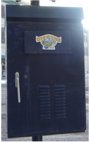
Central Ave & 2nd St N Central Ave & 3rd St N Central Ave & 5th St N Central Ave & 6th St N Central Ave & 7th St N BEFORE