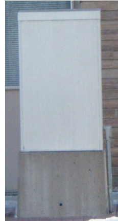
Central Ave & Park Dr and 2nd Ave S & 2nd St BEFORE